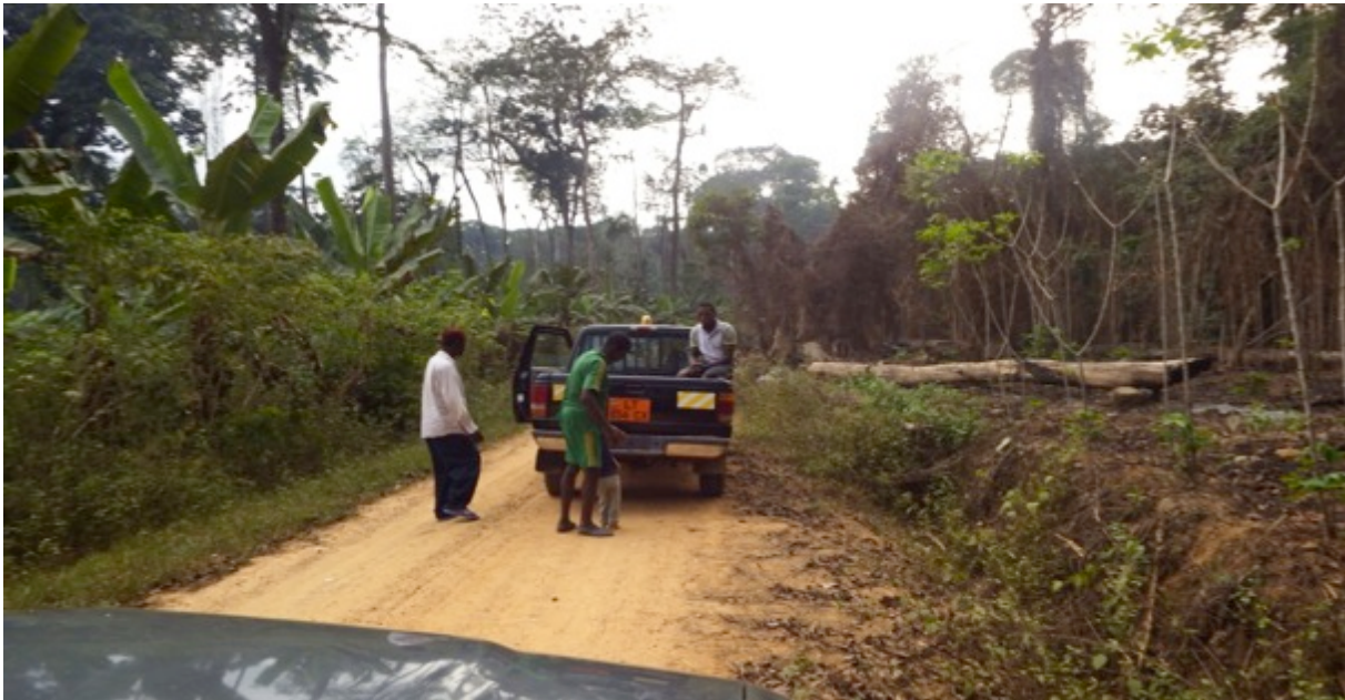
Fig 17: The chief of Fonjo village allocating land for the establishment of a processing center to handle produce from the village and neighboring villages

The personnel in Cameroon working on Balmed presence are making good progress , in sensidising farmers on the Balmed planting and trading model. The personnel and sourcing land for planting and selecting strategic areas to set up the processing centers.